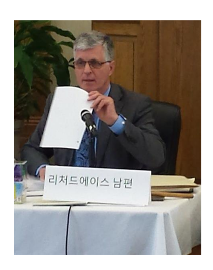
A Korean moment